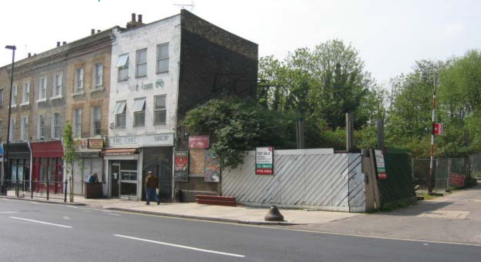
Site viewed from Caledonian Road. Area 'A' on the map.

The draft planning brief recognises that safety and security needs to be improved in the area surrounding the site. To ensure that the site remains safe and secure, all new buildings and landscaping must meet national standards known as 'Secured by Design' which aims to 'design out crime'. The council is exploring the option of opening the site for public access to the nature conservation areas, however this would not be done until safety and security surrounding the site is improved (refer to 'F' on the map).